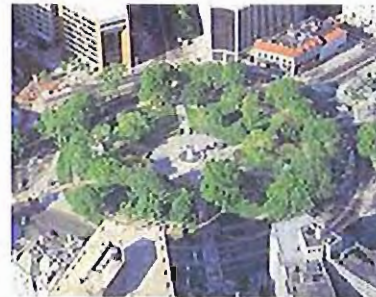
Older traffic circle